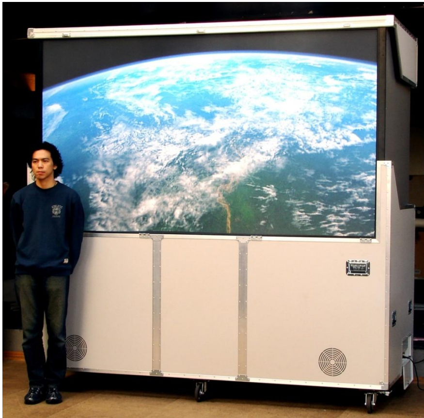
Paradigm Trojan 110HD – pictured in action.

The new Trojan 110HD at 110" is the largest self-contained display in the world, (larger than even the Panasonic 103" plasma panel: 15% larger image area; 7% larger image width). Originally designed and manufactured for the UK Army, it is ideal for events, exhibitions – anywhere requiring large, bright, high resolution screens that can be transported and started quickly, easily and without skilled engineers.